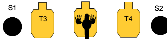
20 yards from P2 to T3, NT, and T4.